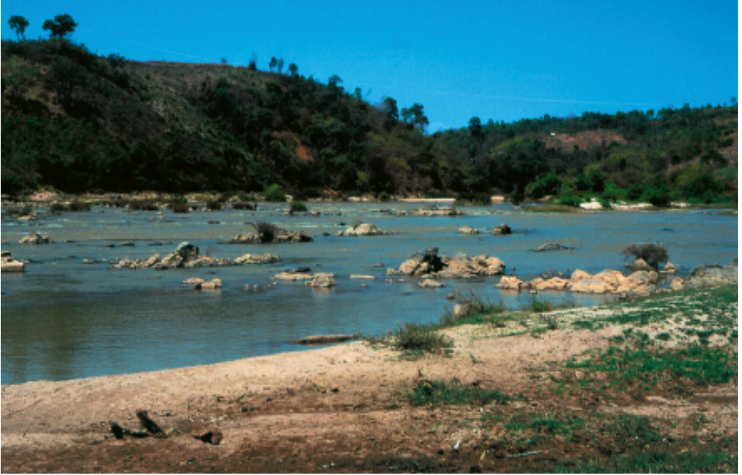
Fig. 4. Habitat of S. albisuera ; Vietnam: River Thu Bon (ZFMK 32910-32913).