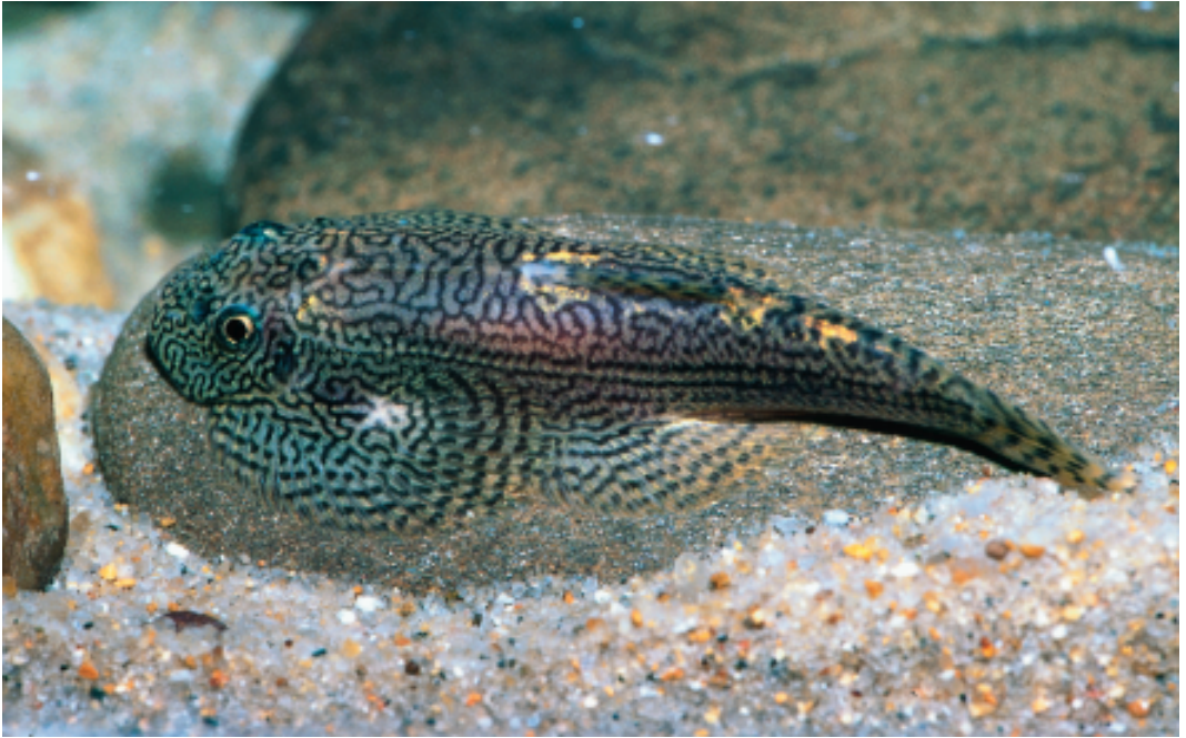
Fig. 1. Sewellia albisuera , about 60 mm SL, not preserved; Vietnam: River Thu Bon, same locality as ZFMK 32910-32913.

streams and/or rivers and their spelling of these names was often different. Co-ordinates were obtained using a Magellan 3000 GPS.