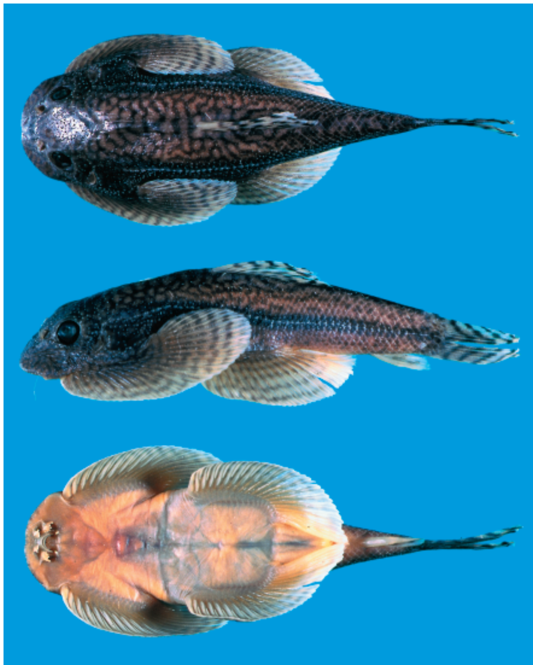
Fig. 2. Sewellia albisuera , ZFMK 32913, holotype, 44.3 mm SL; Vietnam: River River Thu Bon.

split to base. Dorsal-fin margin straight to convex, origin slightly behind or above pelvic-fin origin. Anal fin with 2 simple and 4 branched rays, last one split to base. Second simple anal-fin